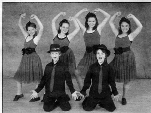
Students from the Beaches Dance and Music Studio